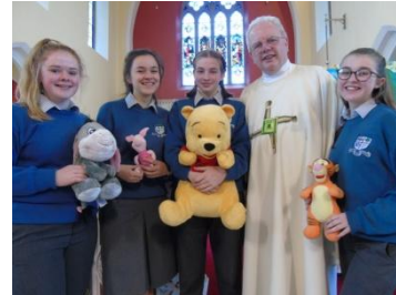
Start of Year Mass