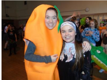
1 st year Meitheal Fancy Dress Halloween Disco